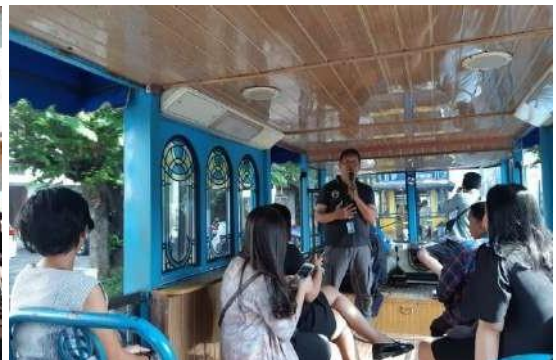
BANDROS ( BANDUNG TOURS ON THE BUS )